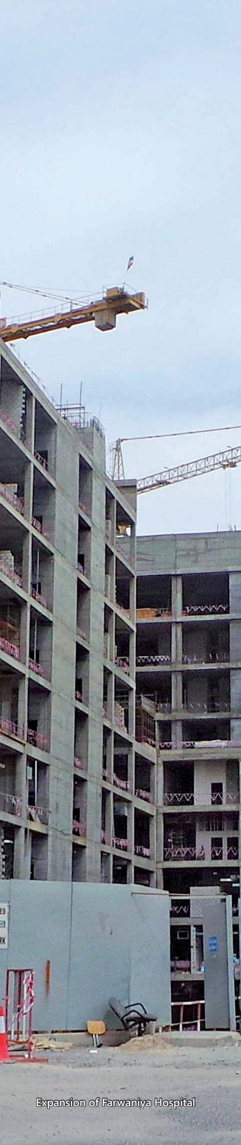
Expansion of Farwaniya Hospital