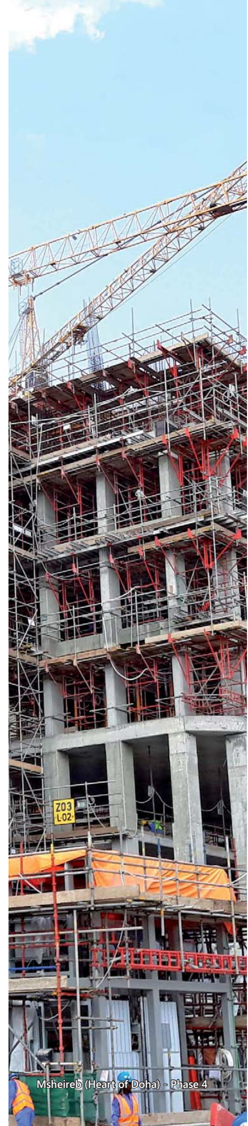
Msheireb (Heart of Doha) - Phase 4

The project involves the construction of a mixed-use development spread over an area of 132,000 square meters. The project will consist of a public plaza and 11 mixed-use buildings, which include commercial offices, residential and retail space, 5-star hotels, medical office building containing clinical and administrative spaces, and six car parking basements.