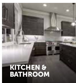
KITCHEN & BATHROOM