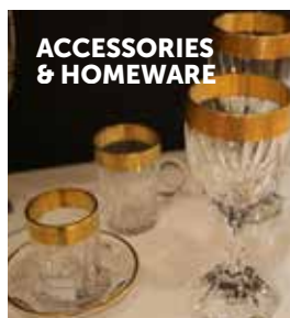
ACCESSORIES & HOMEWARE