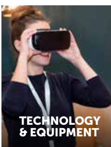
TECHNOLOGY & EQUIPMENT