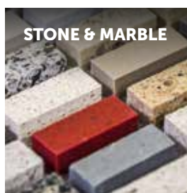
STONE &amp; MARBLE