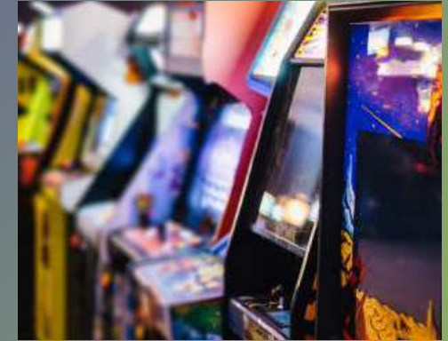
Games & Devices