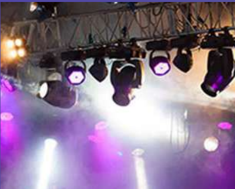
Hi-Tech & Theatrical Equipment