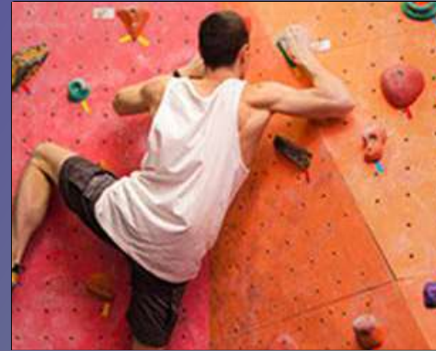
Facility, Grounds & Participatory Equipment