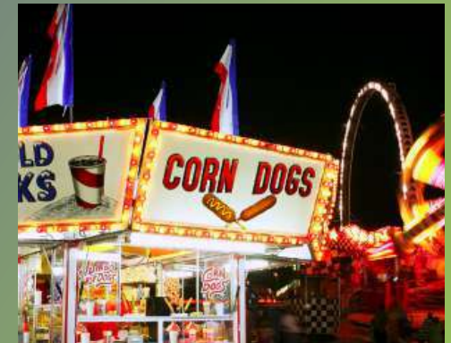
Food & Beverage