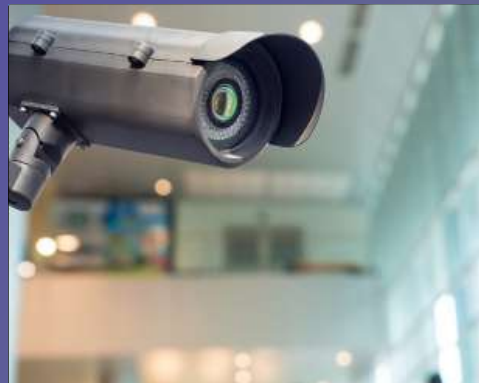
Security Equipment & Safety