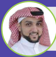
Ahmed Arab Ministry of Tourism Saudi Arabia