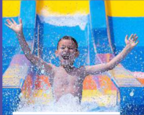
Water-Related Equipment & Supplies