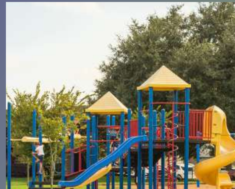
Construction & Consultants