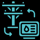
Public Utilities Professionals