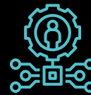
Digital Infrastructure Engineers