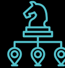
Smart City Strategists