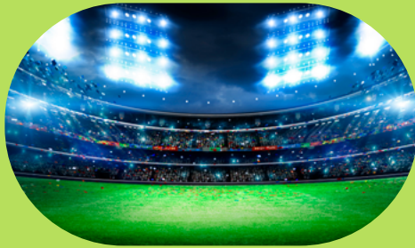
STADIUMS & ARENAS