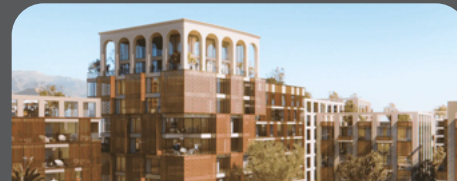
SAUDI DOWNTOWN COMPANY

Defining Riyadh's new skyline, The Mukaab will attract visitors from across the world with its 80 incredible state-of-the-art entertainment, dining, and retail venues. The world's largest modern downtown inner-city building of over 19km 2 is set to be big enough to hold 20 Empire State Buildings.