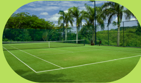
TURNKEY SPORTS FACILITIES