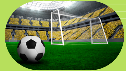
SPORTS SURFACES & EQUIPMENT