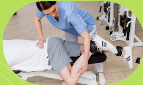
SPORTS MEDICINE & REHABILITATION