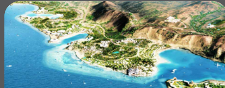
JEDDAH CENTRAL PROJECT

The challenge is on for NEOM, the next global hub for sport, that holds physical activity and innovation at its very core. NEOM is set to become a top destination for major sporting events, partnering with global sports brands, championing outstanding livability for residents and contributing to NEOM's innovative economy.