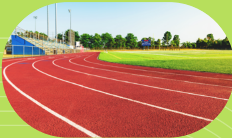
SPORTS GROUND MAINTENANCE