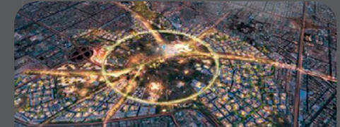
KING SALMAN PARK

Trojena is the first major outdoor skiing destination in the GCC. Located in the kingdom's highest mountain range, it is part of the country's $500 billion high tech mega-city NEOM.