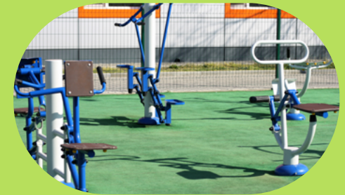
STREET / OUTDOOR FACILITIES